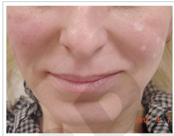
Figure 2. Patient showing the difference of the nasolabial fold: non-treated left side (with site marks for planned HA injection) and right side straight after injection of only 0.5 ml of nonanimal stabilized cross-linked HA ("Stalagmite" technique on the right cheek).

Products injected within or beneath the skin to improve its physical features by soft tissue augmentation are known as